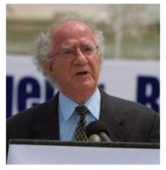
Former Chinese leader Jiang Zemin faces charges of genocide, torture, and crimes against humanity in a U.S. District Court

"It is indeed a great honor to be recognized by one of America's leading medical societies for my efforts to make known to the world the blatant misuse of psychiatry in the People's Republic of China by the wrongful detention of non-mentally-ill Falun Gong practitioners and political dissidents in psychiatric institutions..."