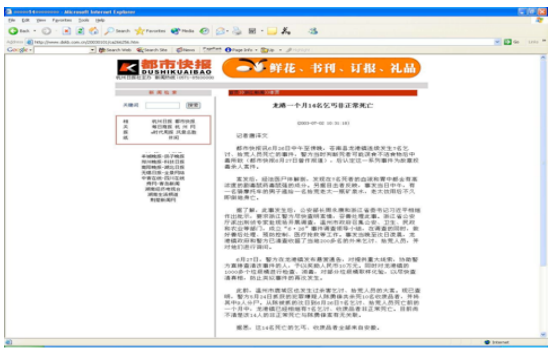
Fig. 2: A screenshot of the local report on the "Metropolitan Express" (Du Shi Kuai Bao) newspaper

hwww.upholdjustice.org Tel: 001-347-448-5790 Fax: 001-347-402-1444