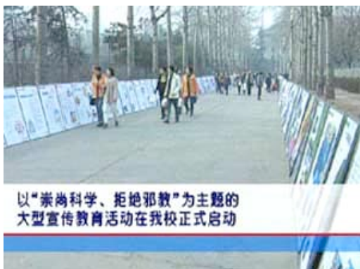
Figure 3. Anti-Falun Gong photo exhibit on the main Street in the campus of Beijing Foreign Languages University

Chen Zhili, the former Minister of Education and the Party Secretary of the Chinese Ministry of Education, actively implemented and promoted Jiang's genocide policy within the education system, and exhausted a large portion of the funds earmarked for education by diverting them towards the persecution of Falun Gong. Specifically, those funds were used for blocking information access and exchange on the Internet about Falun Gong. Chen Zhili requested that all higher educational organizations redirect their technological research and development toward Internet monitoring and blocking. In addition to making concerted efforts to develop new Internet monitoring and blocking software and providing technical support for new Internet monitoring technology, Ministry of Education requested that the educational departments at all levels provide, under the direction of the local Party Committees, various kinds of campus-wide "seminars," performances, photo exhibits, book and art shows, popular science demonstrations, student organization activities, bulletin board displays, posters, videos, and VCDs, as well as student publications that slandered and vilified Falun Gong. School officials and the Ministry of Education have also directed students to demonstrate in the streets and distribute anti-Falun Gong flyers and VCDs.