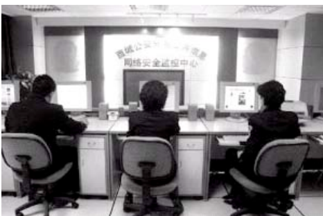
Figure 6. Chinese Ambassador in France introducing photo exhibits to personnel in various circles in France and Overseas Chinese in France

All varieties of propaganda materials have been manufactured to slander Falun Gong and incite hatred, including books, many kinds of pamphlets, and VCDs. Overseas Chinese Communities, libraries, schools and bookstores have become the destinations of the slanderous materials.