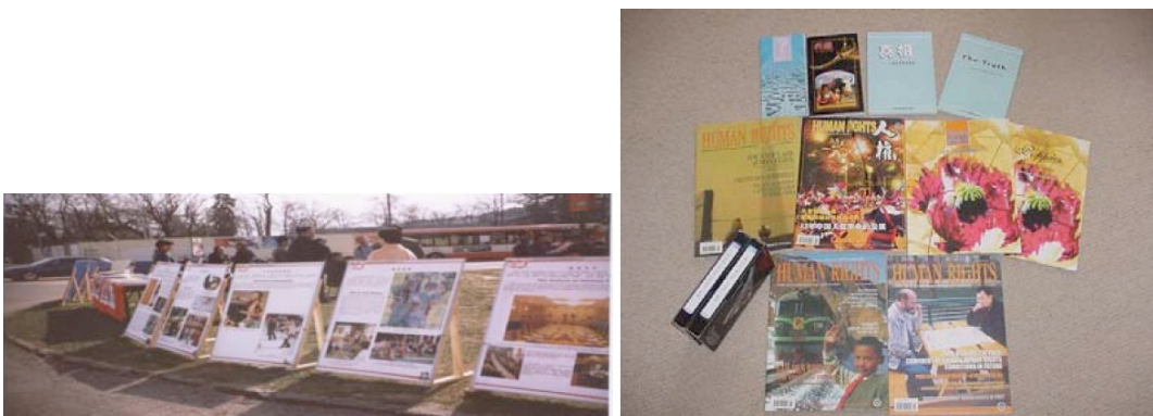
Figure 4. Propaganda exhibits against Falun Gong, held at the United Nations.