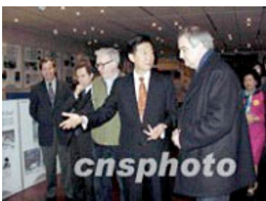
Figure 7. Falun Gong practitioners from different countries barred from boarding Icelandair at Paris airport were on hunger strike. Jiang's ruffian regime coerced Iceland government to prevent practitioners from entering the country during his state visit.

On June 5, 2003, the Icelandic Data Protection Authority reached the final judgment regarding the justice ministry blocking Falun Gong practitioners from entering the country based on blacklists. The verdict stated: "It was a violation of law that the Justice Ministry of Iceland provided Falun Gong practitioners personal information to Icelandair and that Icelandic Embassies in the U.S., Norway, Denmark, U.K. and France used the blacklists to block Falun Gong practitioners from entering the Iceland.[107]"