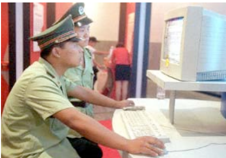
Figure 5. Chinese Police Enforcing Censorship Inside Internet Café

Development of software that will intercept information and prevent facts about Falun Gong from being spread: According to the Software Industry Project Information web site of Shenyang City, Shenyang Situo Network Technology Ltd. has invested one million yuan (US$ 120,824) to develop the "Technology for Illegal Internet Information Recognition and Filtering Based on NLP." The function of this technology is to live-monitor information exchanged over the Internet and immediately report the user to the police from backstage. It has been widely used in personal PC, local network, websites and Internet monitoring departments, and thus directly involved in the persecution of Falun Gong. Universities and research institutions in China have also participated in the development of "Golden Shield Project." Chen Zhili, the former minister of Department of Education, called on universities to strengthen the research in development of Internet blockage technology and focus on developing new software and hardware to block information flow on internet, so as to provide advanced technology to block all "Falun Gong" related information on the Internet.