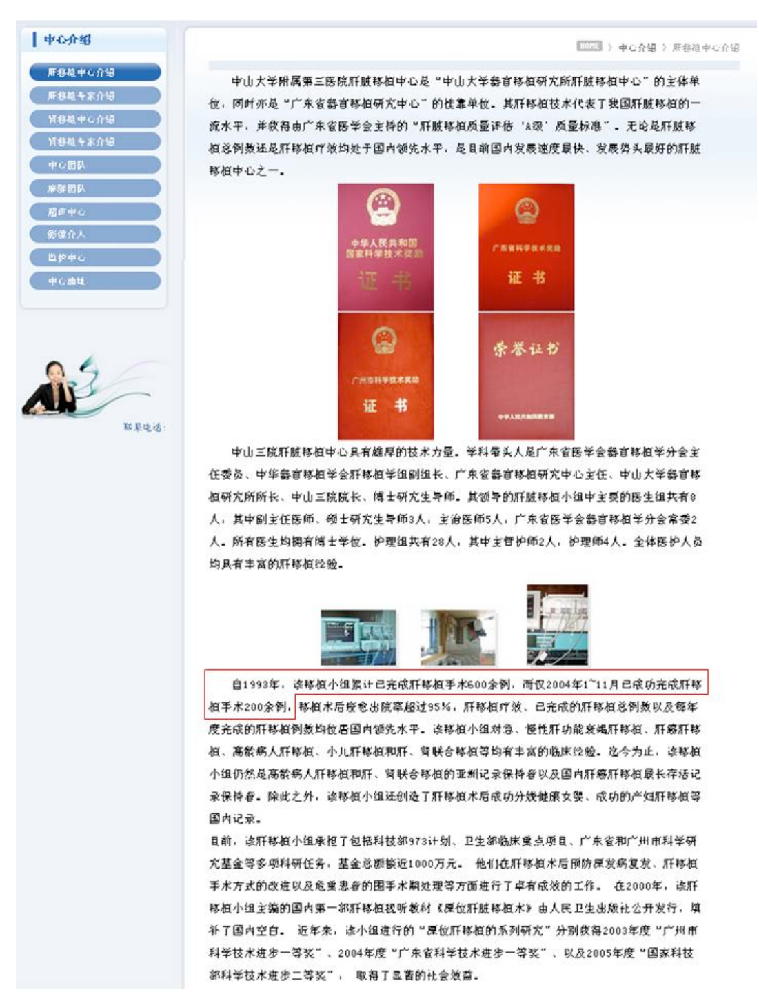
Figure 9 Sun Yat-sen University Organ Transplant Institute liver transplant department page (archived copy)

The liver transplant department page (Figure 9) says that "since 1993, the department conducted over 600 liver transplants." From January to November 2004 alone, the department conducted over 200 liver transplants."