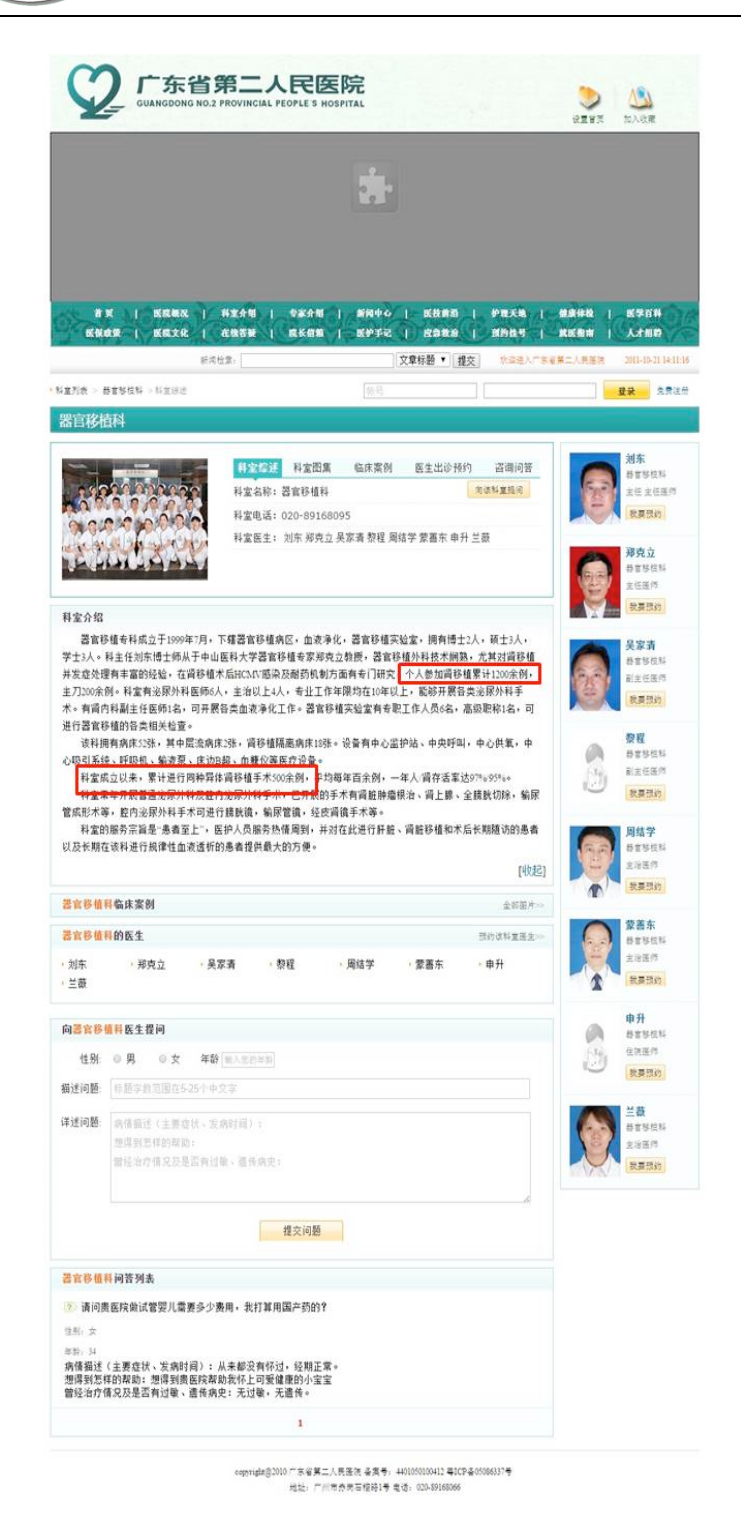
Figure 6 Newer version of Guangdong No.2 People's Hospital Organ Transplant Department introduction page(archived on March 18, 2015)

hwww.upholdjustice.org Tel: 001-347-448-5790 Fax: 001-347-402-1444