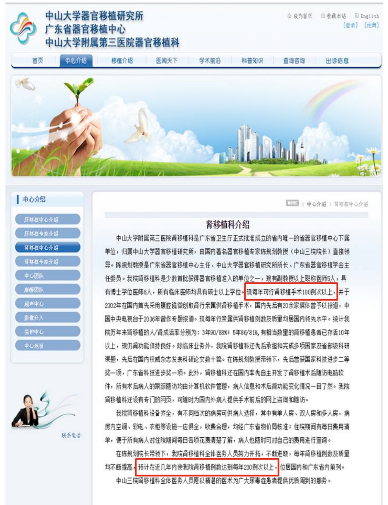
Figure 8 Sun Yat-sen University Organ Transplant Institute Kidney transplant department page (archived copy)