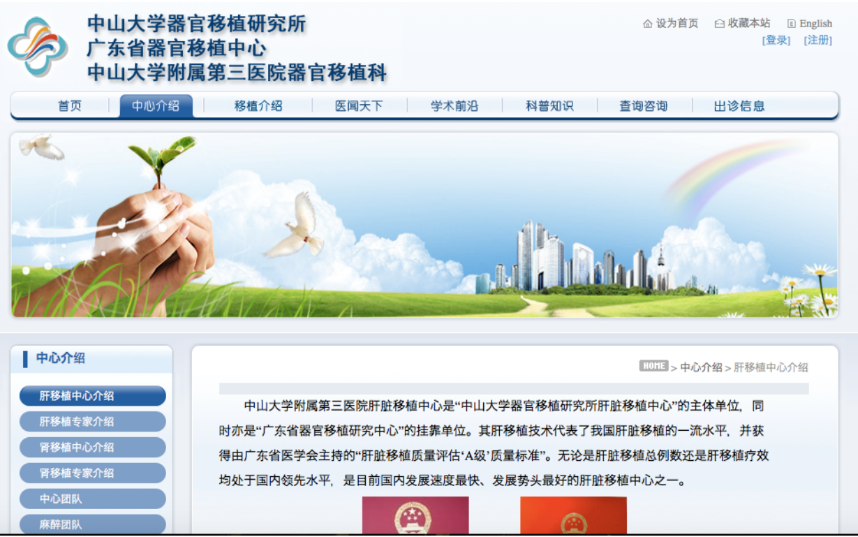
Figure 7 Original homepage of Sun Yat-sen University Organ Transplant Institute at<u>www.organtransplantation.cn</u> (archived copy)

Sun Yat-sen University No.3 Hospital, Sun Yat-sen University Organ Transplant Institute, Guangdong Organ Transplant Center shared the same website, which address used to be <a href="https://www.organtransplantation.cn">www.organtransplantation.cn</a>. It has a suite of webpages detailing its departments and accomplishments. Figure 7 shows the original homepage of the website.