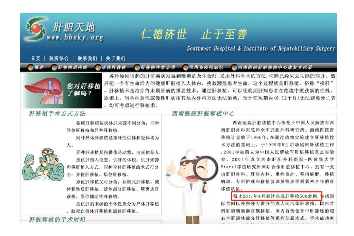
Figure 3: Southwest Hospital Affiliated to No.3 Military Medical University webpage (archived on March 9, 2015)

However, as shown in Figure 3, the introductory page of the Southwest Hospital & Institute of Hepatobiliary Surgery Department displays the following information on its official website: "Clinical liver transplant started in May 1999... By April 2011, Southwest Hospital had cumulatively conducted over 500 liver transplants<sup>[2]</sup>."