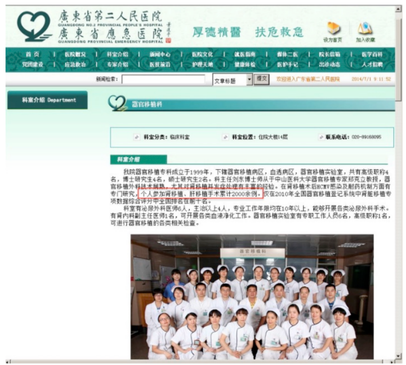
Figure 4. Guangdong No.2 Provincial People's HospitalOrgan Transplant Department Intro page (Archived on July 1, 2014)

Figure 4 shows the top portion of the old webpage which is an introduction of the Organ Transplant Department. The page was archived on July 1, 2014. The first paragraph stated: "Our Organ Transplant Department was established in 1999... The department head, Dr. Liu Dong studied under Dr. Zheng Keli from Sen Yat-sen Medical University... He has personally participated in over 2,000 kidney and liver transplants. In 2010, Dr. Liu's kidney transplant comprehensive score ranked in the top ten in the nation [3]."