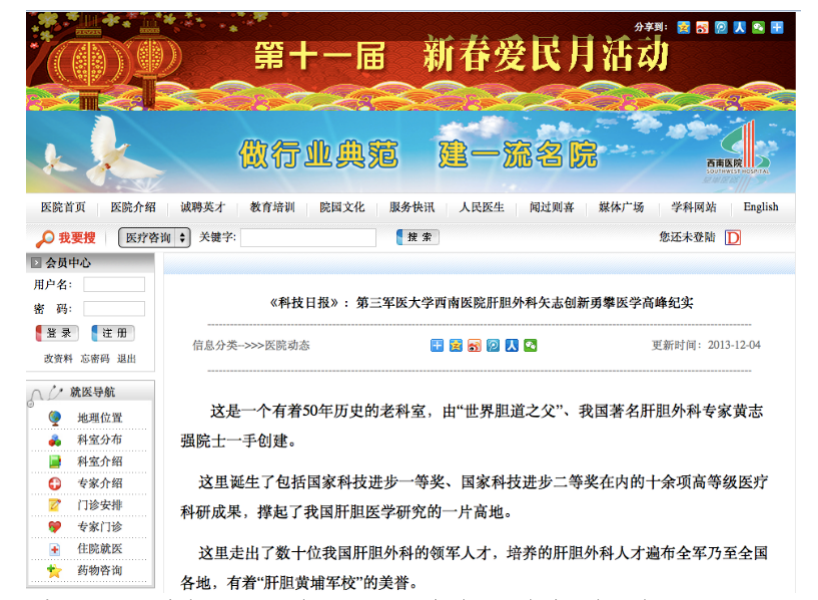
Figure 1 Article on Southwest Hospital's website dated Dec. 4, 2013

On the website of Southwest Hospital, there is an article dated Dec. 4, 2013 as shown in Figure 1. The article is entitled "No. 3 Military Medical University Southwest Hospital Institute of Hepatobiliary Surgery striving to climb the peak of medical technology."