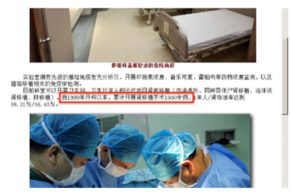
Figure 5. Guangdong No.2 Provincial People's HospitalOrgan Transplant Department Intro page (archived on July 1, 2014)

Scroll down on the same page, as shown in Figure 5, it has a picture of the hospital ward and a picture of a kidney transplant in action. The paragraph right in between the pictures stated: "Since 1999, our department has cumulatively conducted over 1,000 kidney transplants."